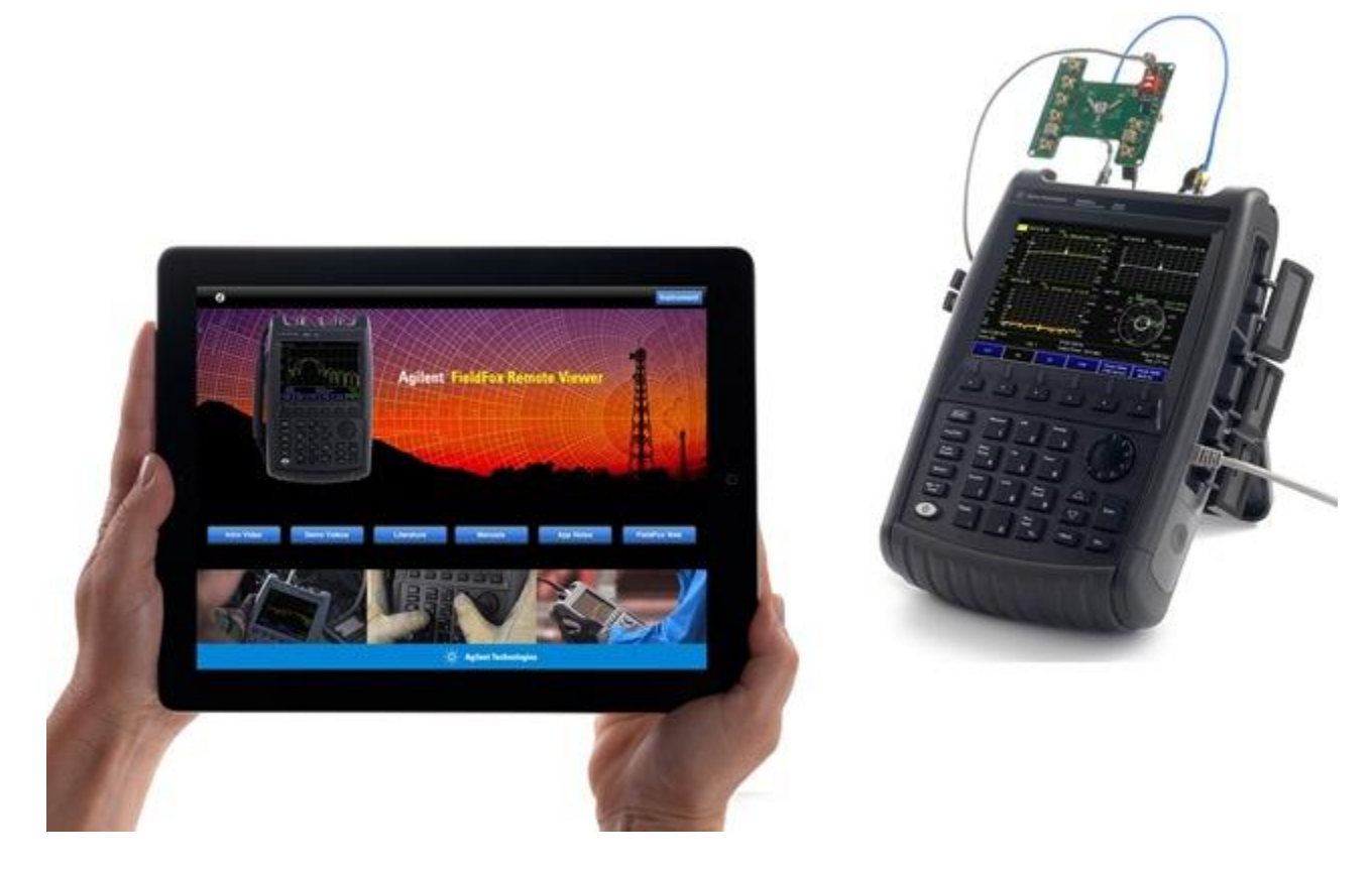
FieldFox handheld analyzers can now be operated remotley using iPads or iPhones

Also new to the instrument are a spectrum analysis time-gating option (Option 238) and support for Agilent's USB peak-power sensors (Option 302). The spectrum analysis time-gating function is specifically geared toward engineers testing the pulse characteristics of their radar systems. Unlike competing solutions, the instrument's time-gating function allows users to view both frequency and time domain at the same time, and it can measure very narrow pulses (less than 1us wide) with sweep time as small as 8 us. Enhanced trigger functions (burst trigger and pre-trigger, for example) further ease the signal-measurement challenge.