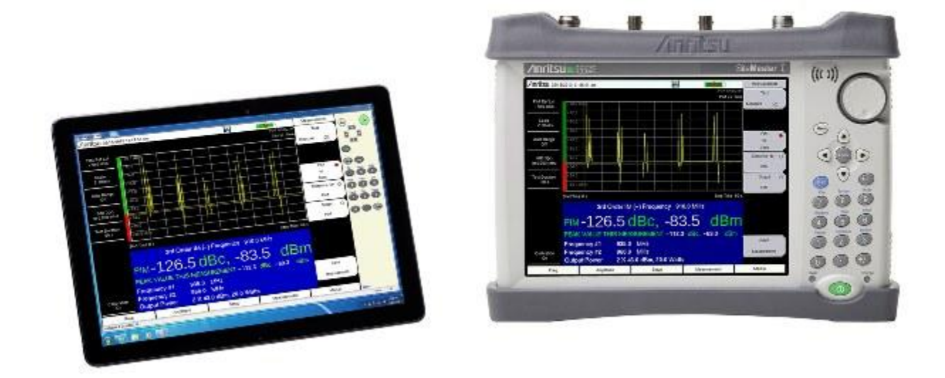
A number of portable instruments from Anritsu, such as the SiteMaster seen here on the right, can be operated remotely using a Windows-based tablet or other WIndows device.

leading field instruments using a Windows-based tablet, laptop, or PC to simplify deployment and maintenance of 2G/3G/4G wireless networks.